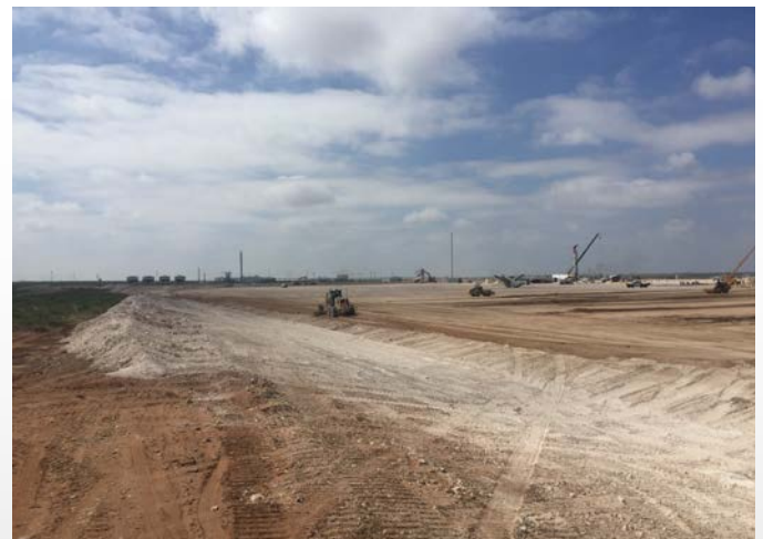
Heavy machinery dirt work