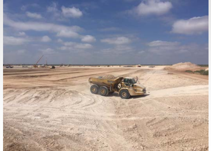
Oilfield Pad Construction