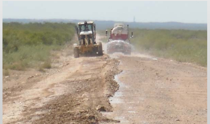
Road Installation and Repairs