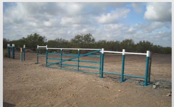
H-Brace and Gate Installation