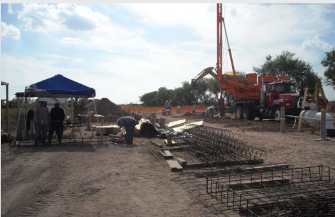
Steel Re-Bar Fabrications