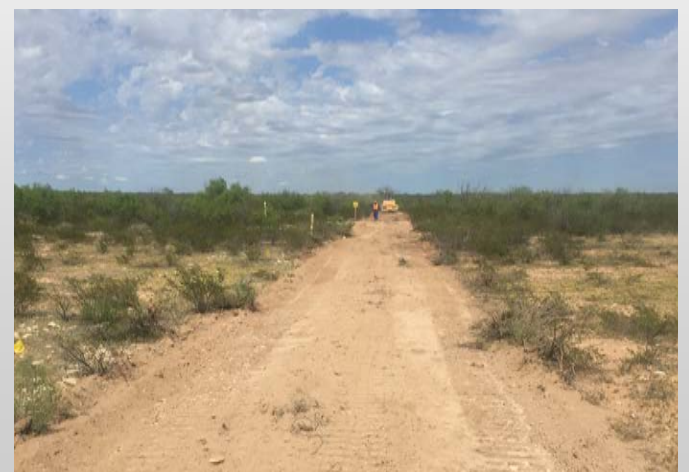
Beginning of road construction in west Texas