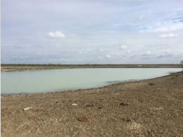
1 million BBL Frac Pit Located in Los Angeles, Texas

Our crews have the experience to build you or your company's next metal building or barn.