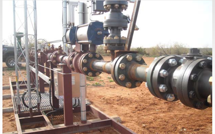
Meter Run Installations