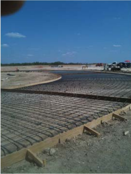
Truck Loading, Rack Driveways & Turnarounds

From sidewalks to low water crossing K5 can handle all of your concrete needs.