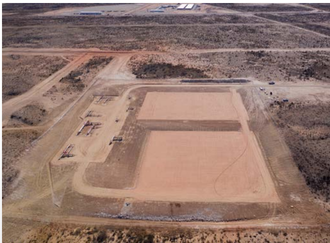
Oilfield Pad in west Texas