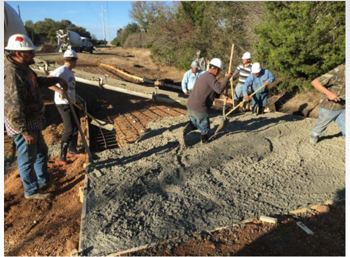
Pouring Low Water Crossing