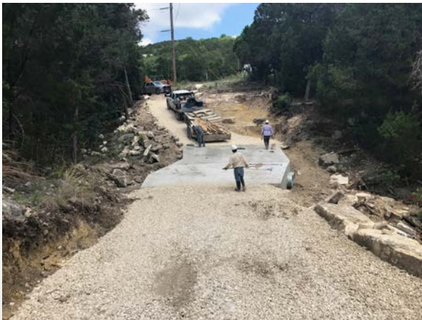
Low Water Crossing Installation