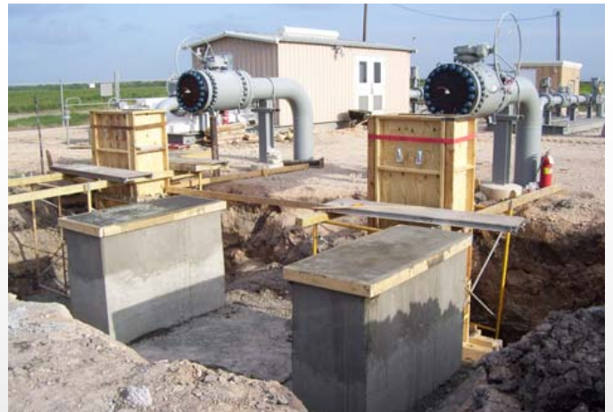
Separator Foundation Slab & Piers