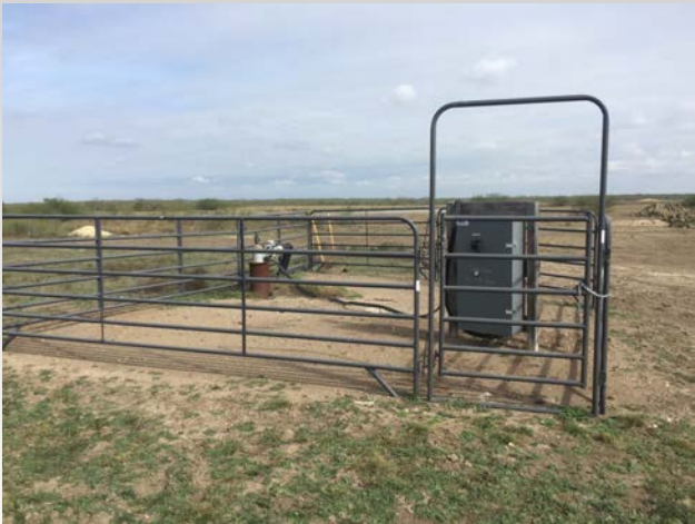
1000 GPM Carrizo Water Well