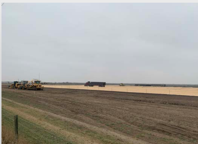
Pipe being delivered to newly constructed pad in south Texas