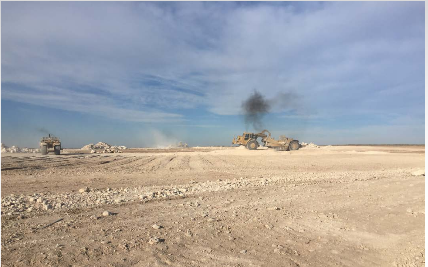
Pictured above: K5 Services oilfield pad construction in west Texas.

K5 Services, LLC is a full service maintenance entity. Our goal, is to build a long-term relationship, and with our combined 60 years of professional experience, K5 Services, LLC will see your projects through the completion of your deadlines. With focus on safety, quality and cost-effectiveness, K5 Services, LLC will strive for total customer satisfaction along the way. A company is only as good as its people; therefore, these pillars of value are instilled in our employees as their highest expectations, to create a sense of purpose, and take pride in their work. Our success is a direct result of our commitment.