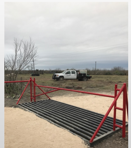
Cattle guard installation