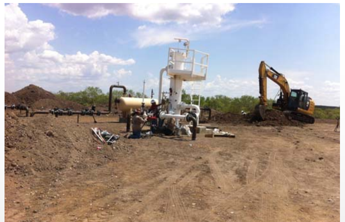
Bolt Up and Screwiping