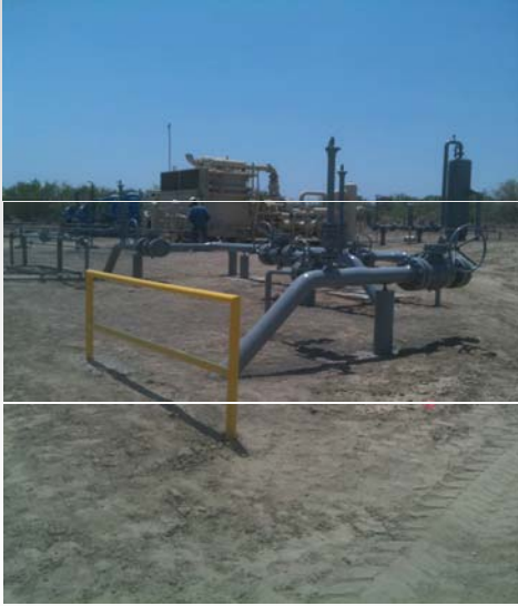
Guardrail and Pig Pen Installation

K5 has a very diverse workforce that can perform to your needs.