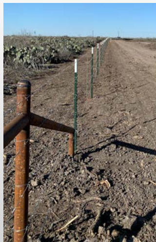
5-strand barbwire fence