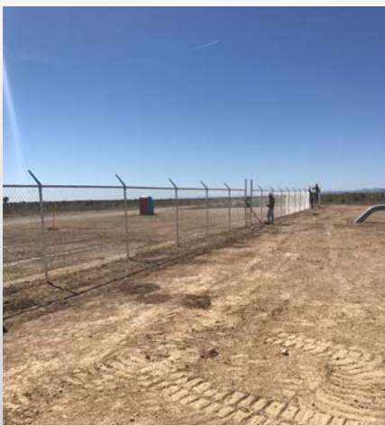
6 Ft Chain Link Fence with 3-strand barbwire